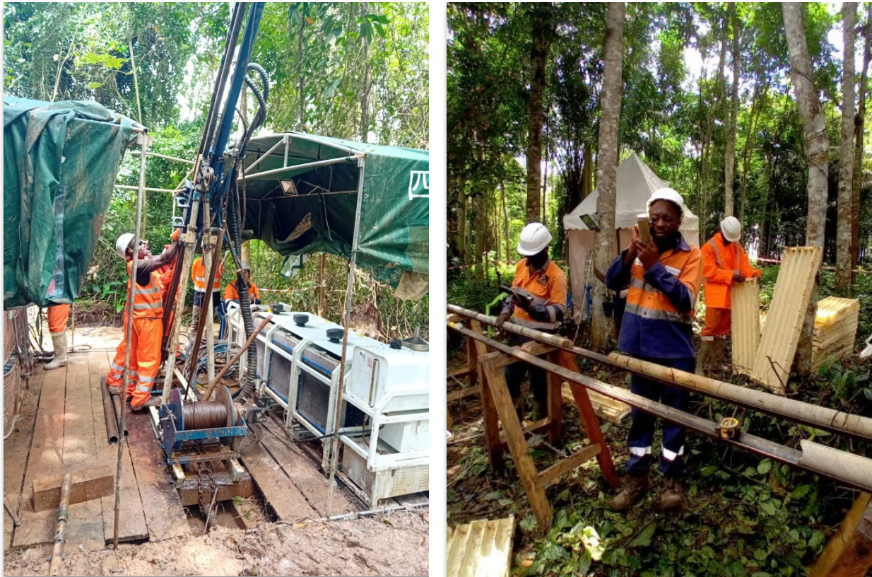
Figure 1 – Rock-800 diamond drill rig and core logging at King Kong

These drill rigs are extremely low impact, thus reducing the need to clear roads or substantial drill pads to undertake the drilling. This allows the Company a great degree of flexibility when planning further holes or moving between drill holes. See Figure 1 below.