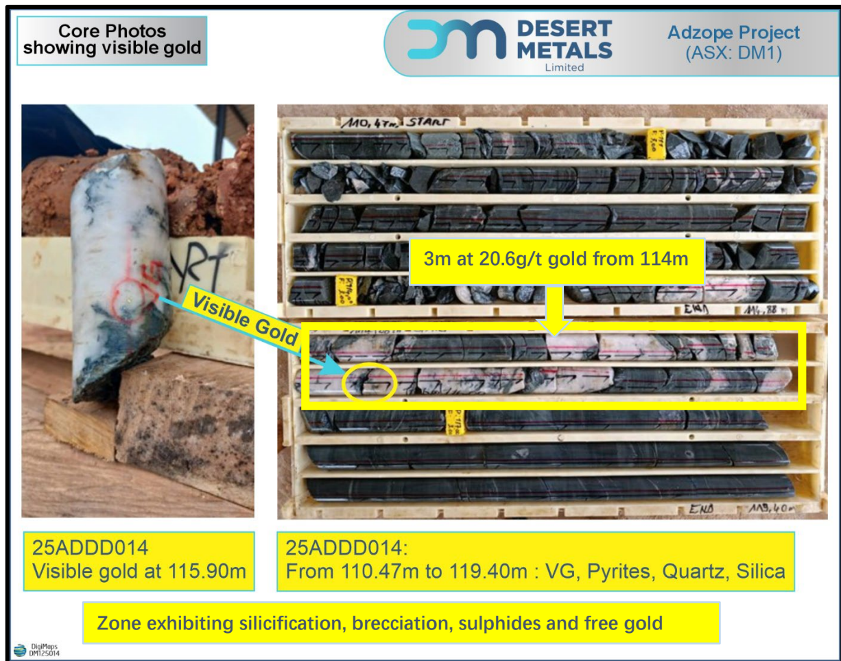
Figure 2 – Hole 24ADDD014 7 110.47m to 119.40m including visible gold