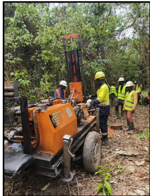
Figures 2 and 3 – Auger sampling at the Adzope gold project