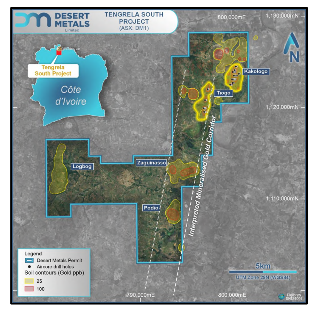
Figure 1 – Kakologo and Tiogo prospects showing gold anomalism and drill hole locations

These targets were defined in a detailed soil sampling campaign completed in mid-2024, which returned two distinct, parallel gold-in-soil trends. The western Tiogo anomaly extends over 3.6 kilometres , while the eastern Kakologo anomaly spans 2.1 kilometres . The soil sampling returned 16 high-grade results exceeding 1.0g/t gold, with peak assays including 32.7g/t , 12.6g/t , and 7.84g/t gold . These anomalies coincide with north-south structural trends typical of gold-hosting systems in this Birimian gold best (Figure 1).